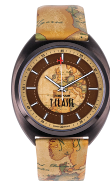
AM2201 - 2

316L Fine Brushed SS Case 42mm Sapphire Crystal Glass Swiss Movement (Ronda Quartz) Genuine Leather GEO print strap. Water resistant 5ATM