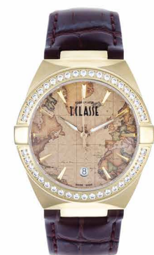
AM1353L - 3

316L Fine Brushed SS Case IPG Bezel 34mm Sapphire Crystal Glass Swiss Movement (Ronda Quartz) Genuine Leather Alligator print strap. Water resistant 5ATM