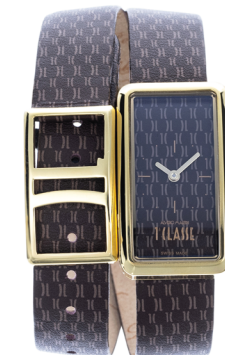
AM2202 - 4

316L Fine Brushed SS Case 35x20mm Sapphire Crystal Glass Swiss Movement (Ronda Quartz) Genuine Leather Monogram strap. Water resistant 5ATM