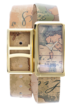
AM2202 - 2

316L Fine Brushed SS Case 35x20mm Sapphire Crystal Glass Swiss Movement (Ronda Quartz) Genuine Leather GEO print strap. Water resistant 5ATM