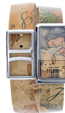
AM2202 - 1

316L Fine Brushed SS Case 35x20mm Sapphire Crystal Glass Swiss Movement (Ronda Quartz) Genuine Leather GEO print strap. Water resistant 5ATM