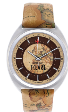
AM2201 - 1

316L Fine Brushed SS Case 42mm Sapphire Crystal Glass Swiss Movement (Ronda Quartz) Genuine Leather GEO print strap. Water resistant 5ATM