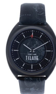
AM2201 - 3

316L Fine Brushed SS Case IP-Brown Bezel 42mm Sapphire Crystal Glass Swiss Movement (Ronda Quartz Chronograph) Genuine Leather Alligator print strap. Water resistant 5ATM