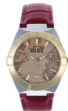
AM1353L - 2

316L Fine Brushed SS Case 34mm Sapphire Crystal Glass Swiss Movement (Ronda Quartz) Genuine Leather Alligator print strap. Water resistant 5ATM