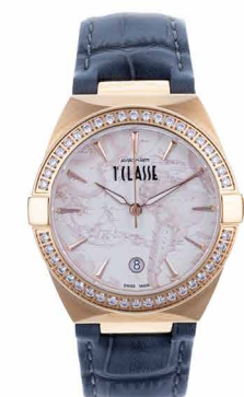
AM1353L - 4

316L Fine Brushed SS/IPG Case 34mm Sapphire Crystal Glass Swiss Movement (Ronda Quartz) Genuine Leather Alligator print strap. Water resistant 5ATM