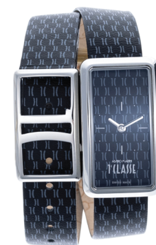
AM2202 - 3

316L Fine Brushed SS/IPG Case 35x20mm Sapphire Crystal Glass Swiss Movement (Ronda Quartz) Genuine Leather GEO print strap. Water resistant 5ATM