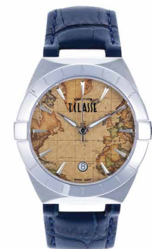
AM1353L - 1

316L Fine Brushed SS Case 34mm Sapphire Crystal Glass Swiss Movement (Ronda Quartz) Genuine Leather Alligator print strap. Water resistant 5ATM